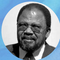
JUSTICE LEX MPATI Retired Judge