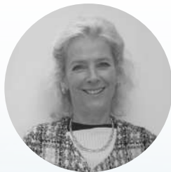
ZI CHANNING IT Systems